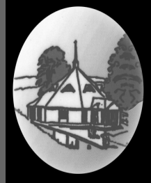
St. Patrick's, Rochestown