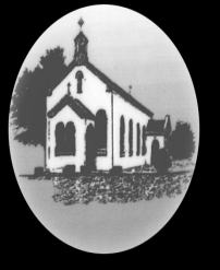
St. Columba's, Douglas

St Columba's Tel: 021 489 4128 (Office) Mobile: 087 2617143